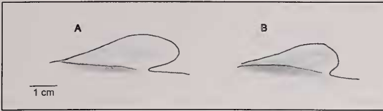
Fig. 4. Relative shape of the adipose fin of A) Galeichthys trowi sp. nov., and B) G. feliceps .